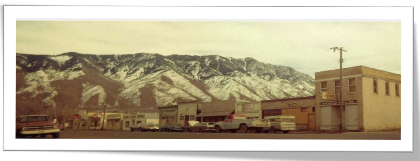
This will be the first of several articles prepared by members of the Historic Preservation Committee.